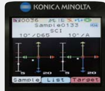
Colour difference graph